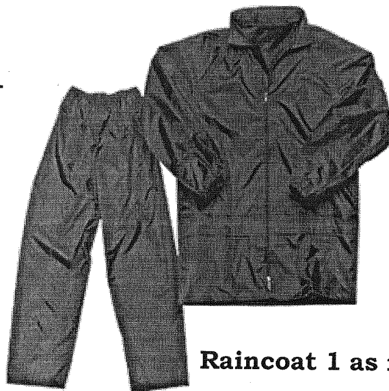
Raincoat 1 as modified PPE