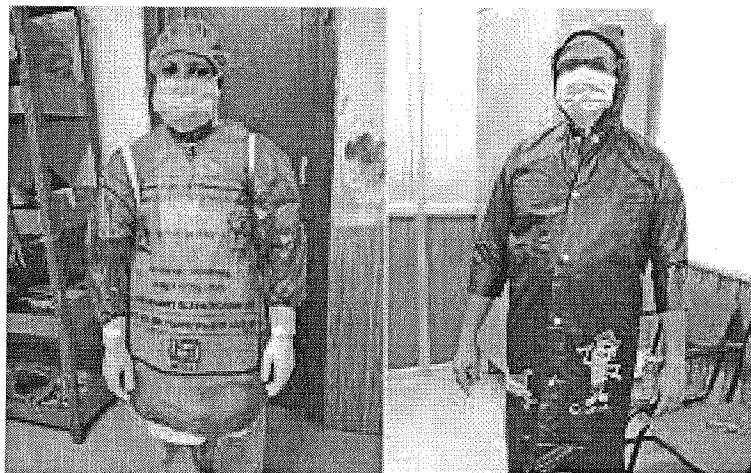
Raincoat 2 as modified PPE